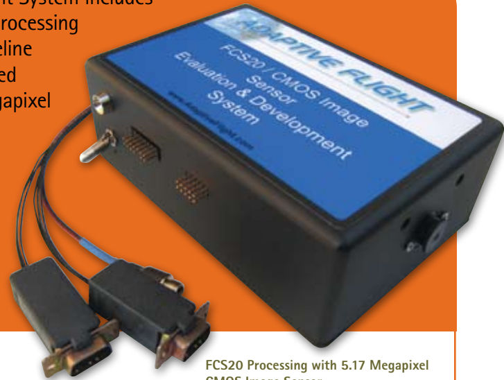
FCS20 Processing with 5.17 Megapixel CMOS Image Sensor

The FCS20 / CMOS Image Sensor Evaluation and Development System includes hardware and software that allow flight control and image processing applications to be developed, tested and integrated. The baseline hardware system includes an Adaptive Flight FCS20 embedded processor, sensor board and an Omnivision OV5610 5.17 Megapixel color CMOS image sensor array. FCS20 embedded software will vary depending on the configuration chosen which may include flight control, image processing or both. Windows-based evaluation, simulation, debug and development software will vary based upon the FCS20 configuration chosen. The entire system is designed and documented for easy integration with third-party applications.